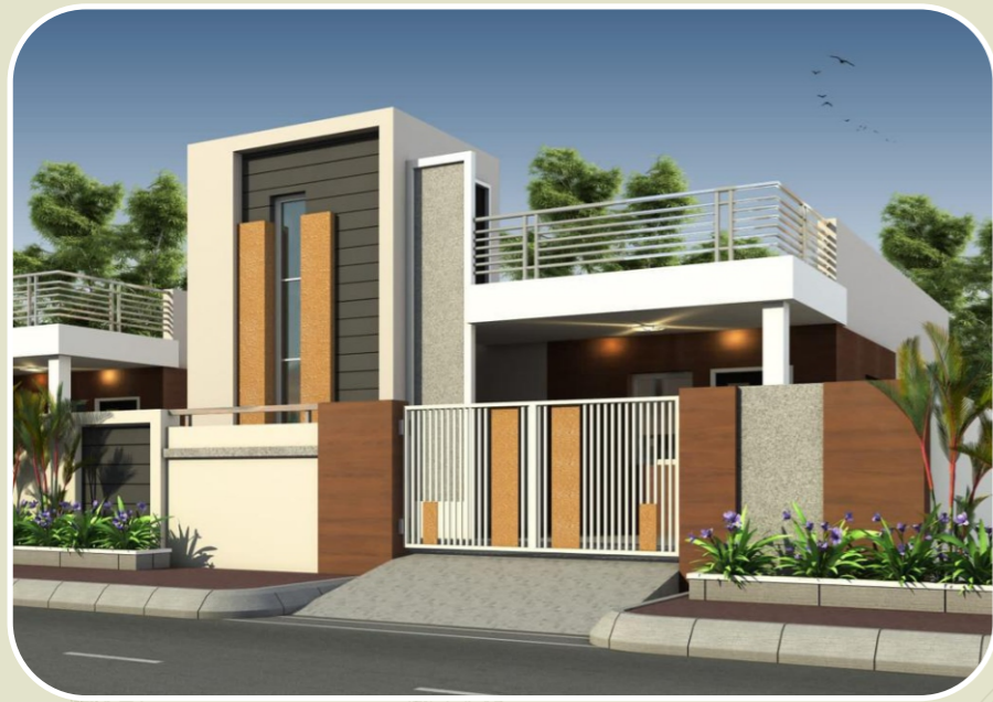
EAST FACING 2 BHK HOME