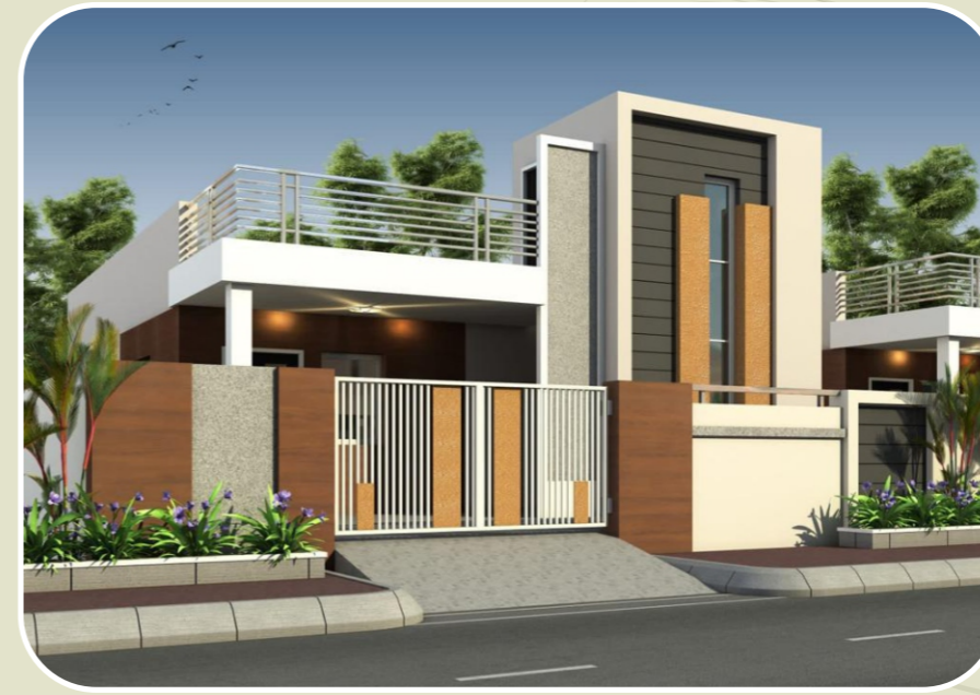
WEST FACING 2 BHK HOME