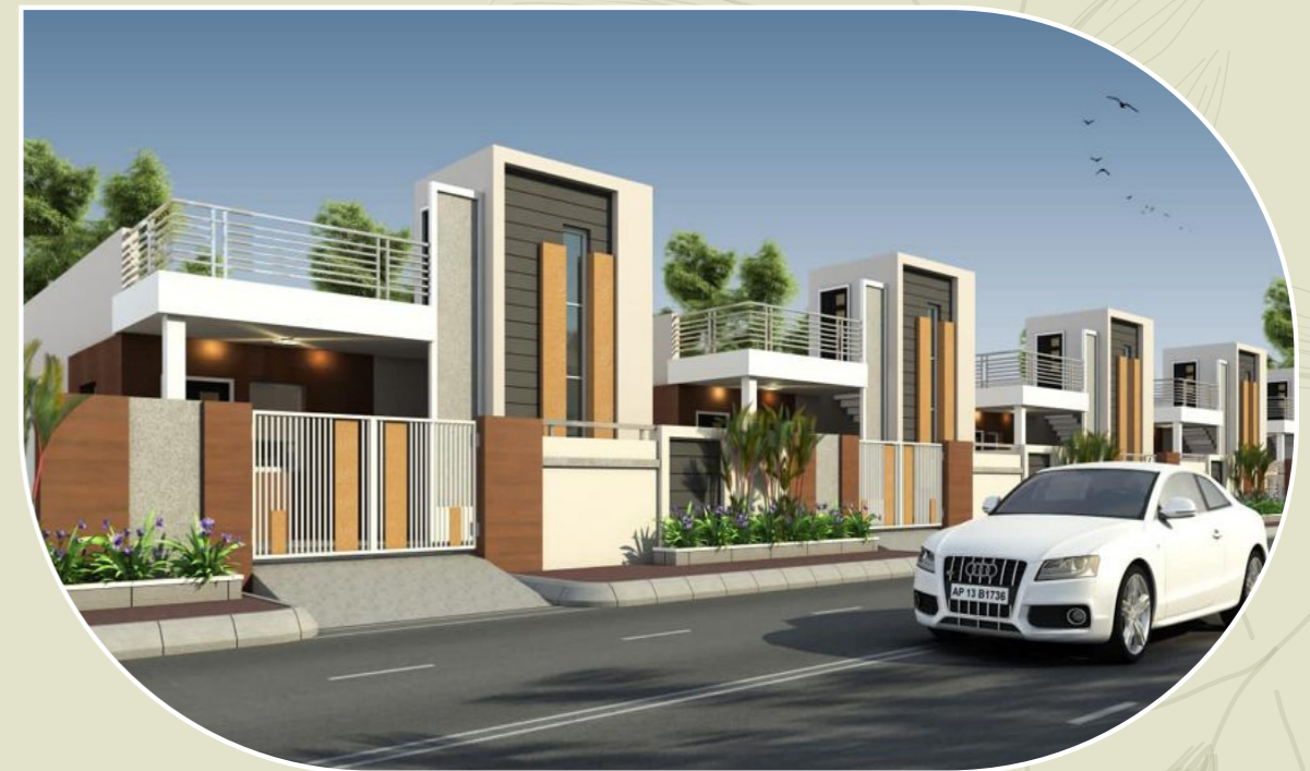
WEST FACING 2 BHK HOME STREET VIEW