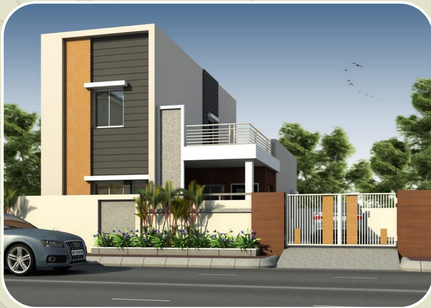
EAST FACING 3 BHK HOME