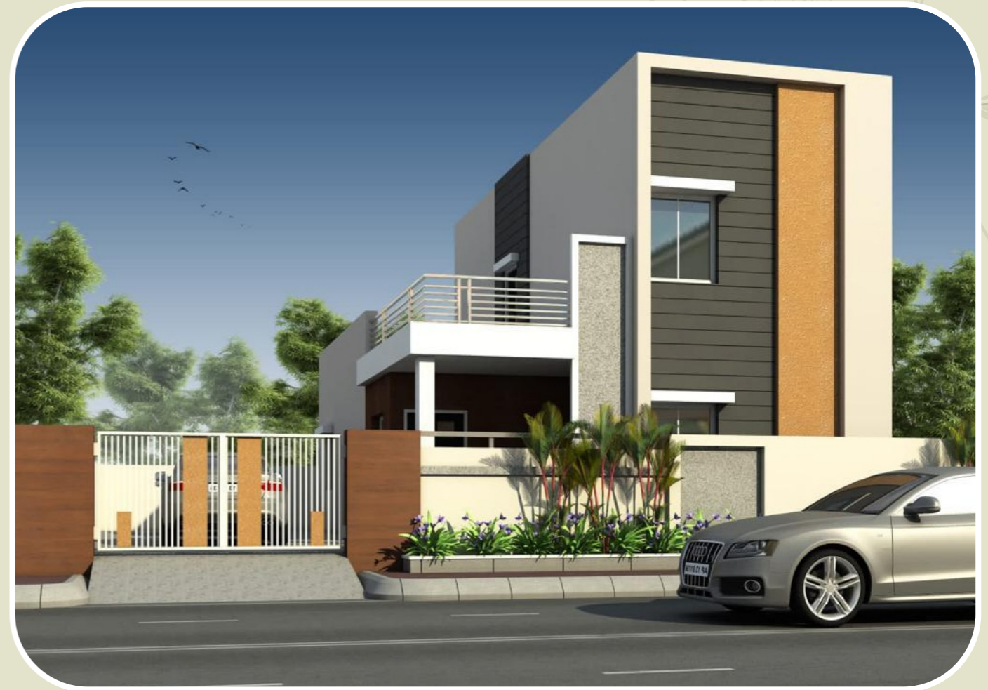
WEST FACING 3 BHK HOME